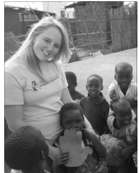
Lending a helping hand in 2010

I believe that development which is sustainable starts with spiritual transformation; without it all the gains made in the lives of people are wiped out and people have no hope. In working with the poor, we must follow in the footsteps of Jesus Christ and show compassion for the people being served. Christian organizations also act as strong partners for churches and encourage them to be involved in issues that communities are faced with. These groups have also functioned as a source for funding for purely Christian activities which governments and secular donors do not support.